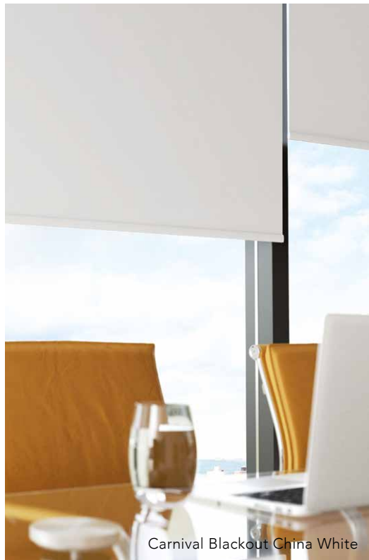
Carnival Blackout China White

Ultra-Fresh treated window blinds are easy to maintain and will preserve their antimicrobial properties even after washing. Perfect for food preparation and serving areas like kitchens and canteens.