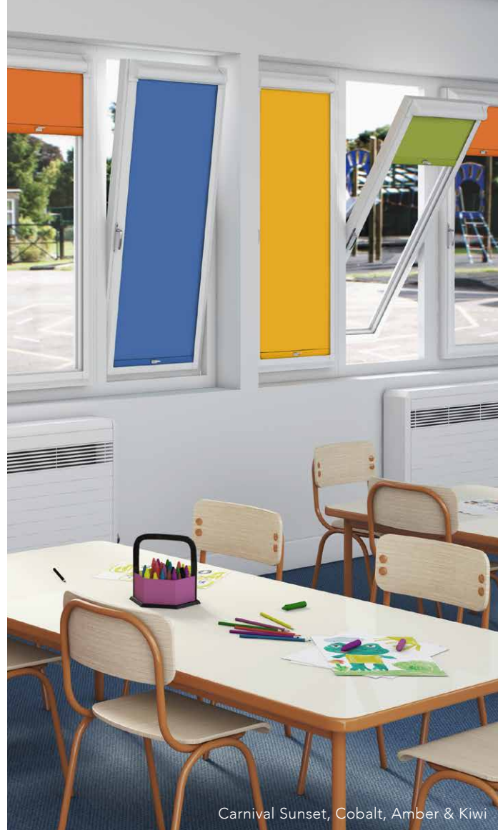
Carnival Sunset, Cobalt, Amber & Kiwi

*Ultra-Fresh® is a registered trademark of Microban Products Company.