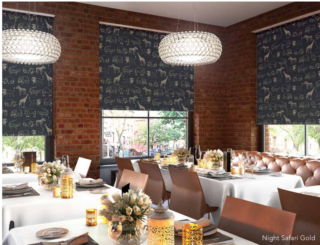
Night Safari Gold