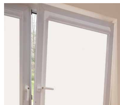
Tilt & turn windows