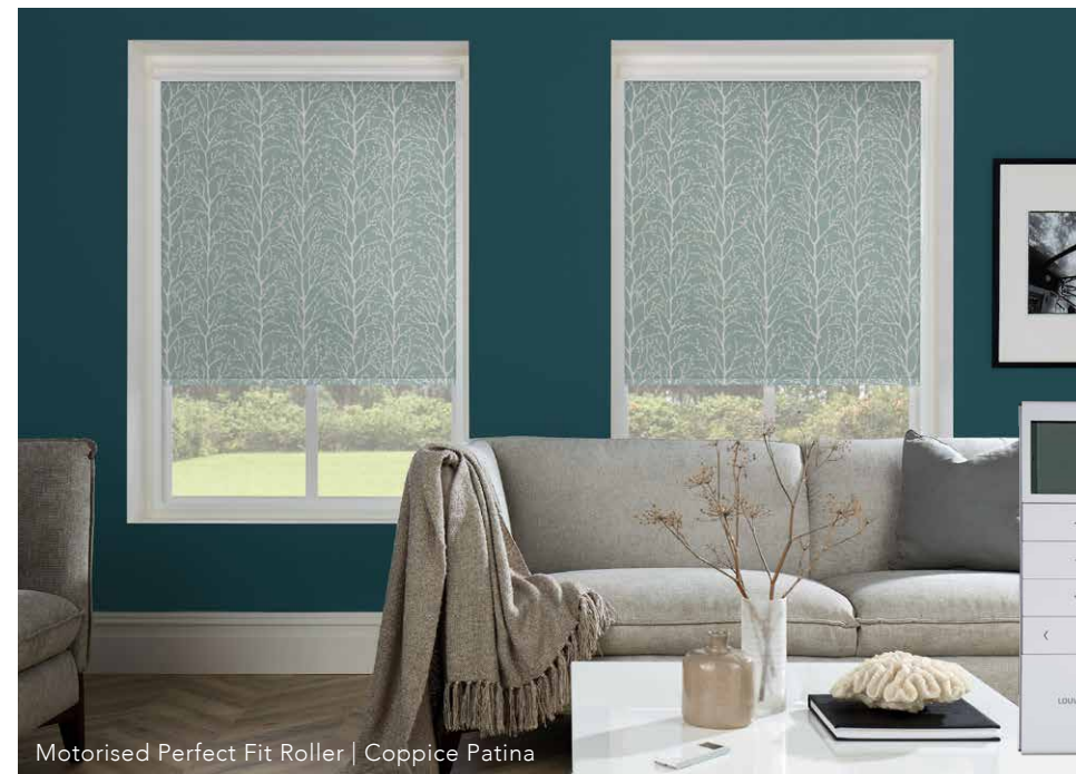
Motorised Perfect Fit Roller | Coppice Patina

We all know that as children grow their curiosity does too which is why we make child safety a real priority. Perfect Fit blinds are a great choice because they don't require pull cords or chains and can now be motorised.