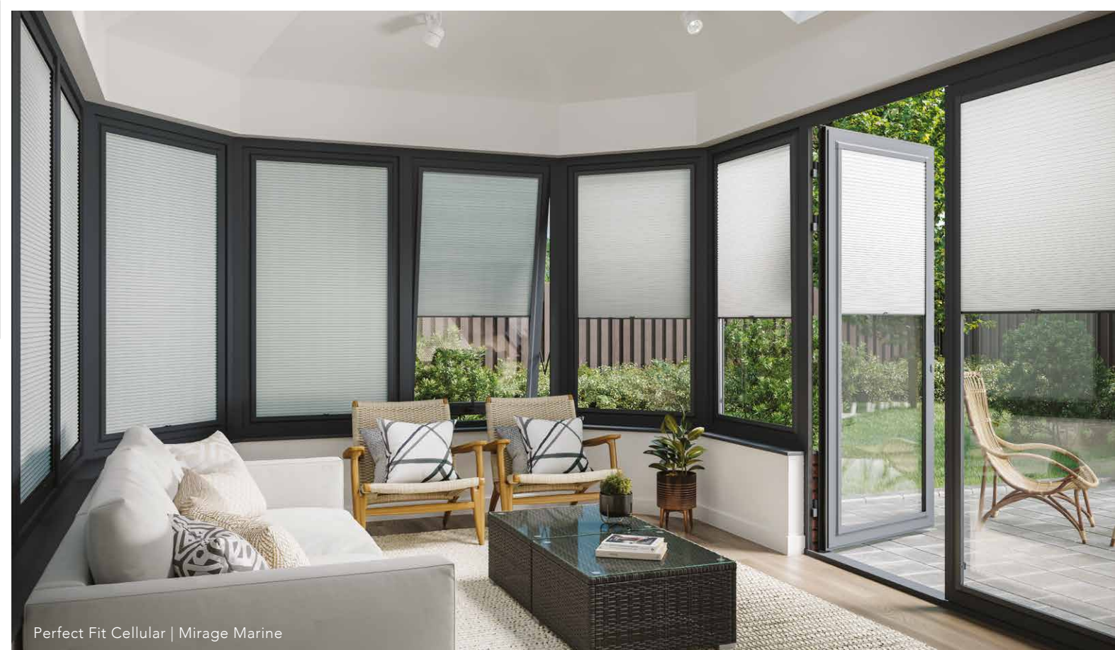
Perfect Fit Cellular | Mirage Marine