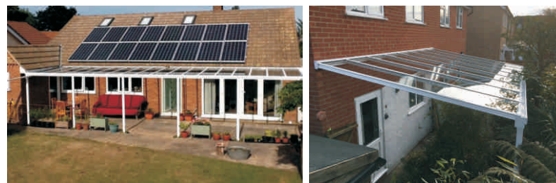
The Simplicity 6