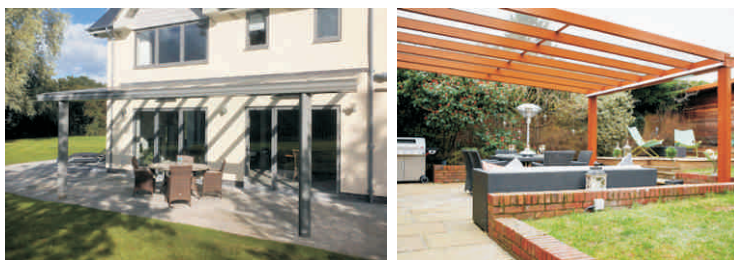
The Simplicity Alfresco

Both structures feature fully aluminium frameworks and hidden, integral guttering. They have been engineered to conform to UK wind and snow loadings.